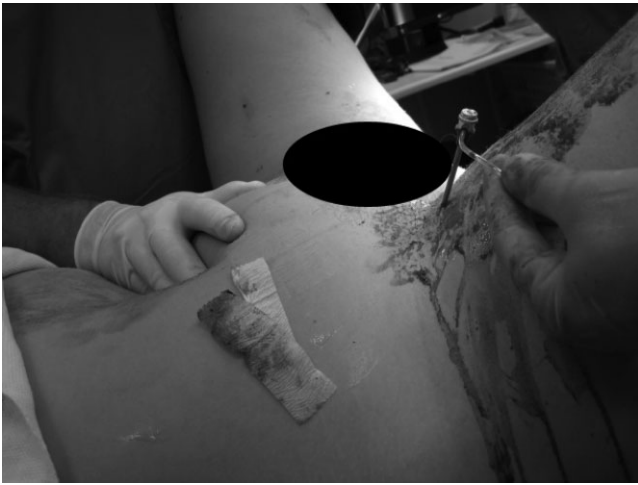
Fig. 2. Patient 3 with an 8 French introducer left in the common right femoral artery after removal of the aortic balloon. The introducer was removed the following day.

and US-guided insertion of an IABO catheter were performed simultaneously. The balloon was inflated, and the BP immediately rose from 70 mmHg to 110 mmHg, and haemostasis was achieved. The balloon was deflated after 15 min. Some bleeding was still observed in the operating field, but after a few additional minutes with the balloon reinflated, the balloon was removed without further bleeding. The estimated total blood loss was 9 l. The introducer was left in place. During the next day, the patient was stable but had minor ongoing bleeding that required transfusion. Embolization of the uterine artery was performed, which resulted in a permanent haemostasis.