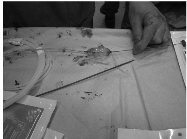
Fig. 1. Picture of the NuMED PTX-S 25 × 30 mm balloon used in patient 3.

An IABO catheter was inserted without the use of US. An initial increase in systolic BP from 40 mmHg to 80 mmHg was achieved after treatment with intravenous volume expanders. The systolic BP increased further from 80 mmHg to 130 mmHg as the balloon was inflated, and partial haemostasis simplified the suturing of the vaginal tears. After 30 min, the balloon was deflated, which was accompanied by a fall in systolic BP to 60 mmHg. Subsequently bleeding was attributed to be mainly caused by atony of the uterus. Afterwards, a hysterectomy was performed; however, vaginal bleeding was observed. Therefore, the patient was taken to the angiography laboratory for embolization, with the balloon still inflated. After deflation of the balloon, no bleeding was observed and embolization was not performed. The balloon was then removed, and the arterial introducer was left in place until the next day. The total estimated blood loss was 10 l.